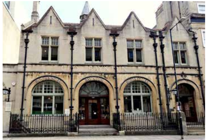
Outside George Bayntun Fine Bindings and Rare Books store