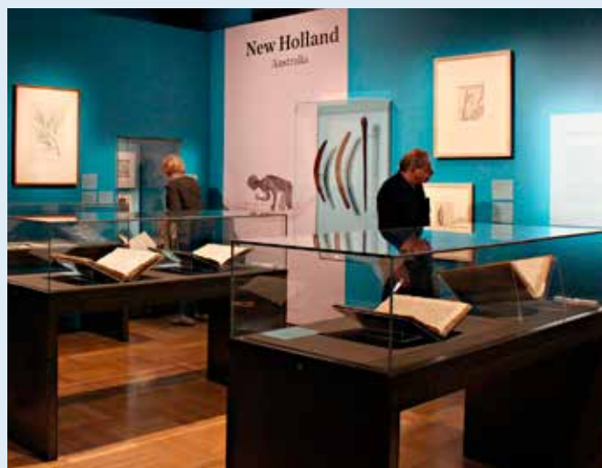
Friends enjoying the Cook and the Pacific exhibition