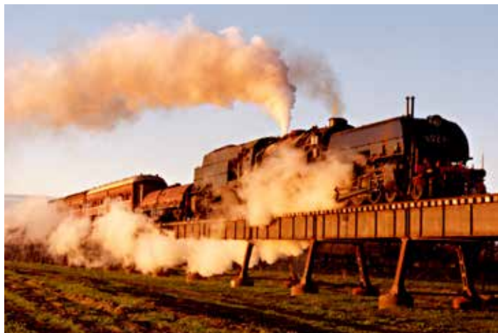
Locomotive 6029 hauling Australian Railway Historical Society Train on the Wagga Viaduct, 1980

the often-humorous observations made by passengers and others. The infamous 'break of gauge' saw passengers, often in the small hours of the night, having to cross the long Albury platform to change trains. No other key stations, says Fisher, not even 'between France and Spain or Poland and Russia', can match the list of famous names who crossed Albury's platform. The list of VIP who partook in this dubious honour includes Queen Victoria, Arthur Conan Doyle, Dame Nellie Melba, The Duke of York (later King George VI), Walter Burley Griffin, Mary MacKillop, Edmund Barton, Agatha Christie and H.G. Wells.