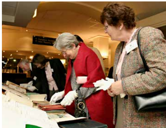
Guests enjoying the 2003 White Gloves event

Special reference must be made to the much-loved White Gloves events. Library staff have given their time and energy to prepare these utterly captivating annual displays showcasing Library treasures, commencing with Garden History Treasures in 2003. Subsequent collection topics have included Revealing Ephemera , From Mao to Manga , the Prompt Collection on Australian Performing Arts and Révolution Française .